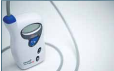
Oscar 2 with SphygmoCor inside