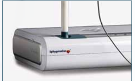
SphygmoCor EM series

SphygmoCor gold standard technology is delivered on three distinct product platforms