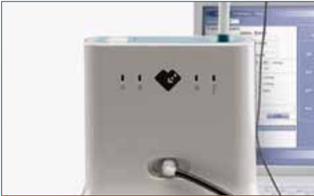
SphygmoCor XCEL series